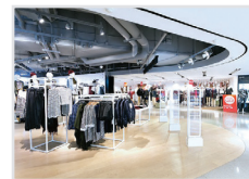
Trade, Franchise, E-Commerce