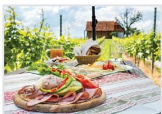
Wine, Fruit, Gardening Agriculture, Food Industry