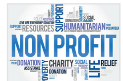
Associations, Bodies of Public Law, Non Profit Organizations