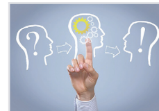
ICT, Entertainment, Creative Economy