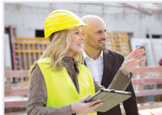
Real Estate Construction