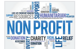
Associations, Bodies of Public Law, Non Profit Organizations