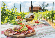
Wine, Fruit, Gardening Agriculture, Food Industry