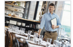
Hotel and Gastronomy, Leisure Industry