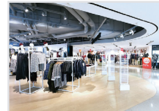
Trade, Franchise, E-Commerce