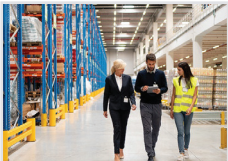
Craft, Trade, Industry