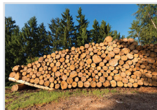
Forestry, Hunting, Fishing, Renewable Energy