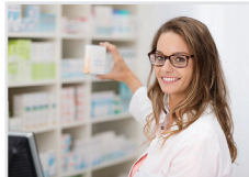
Pharmacies, Doctors Healthcare